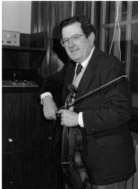
Photograph from ESPA 32-44 (8x10).