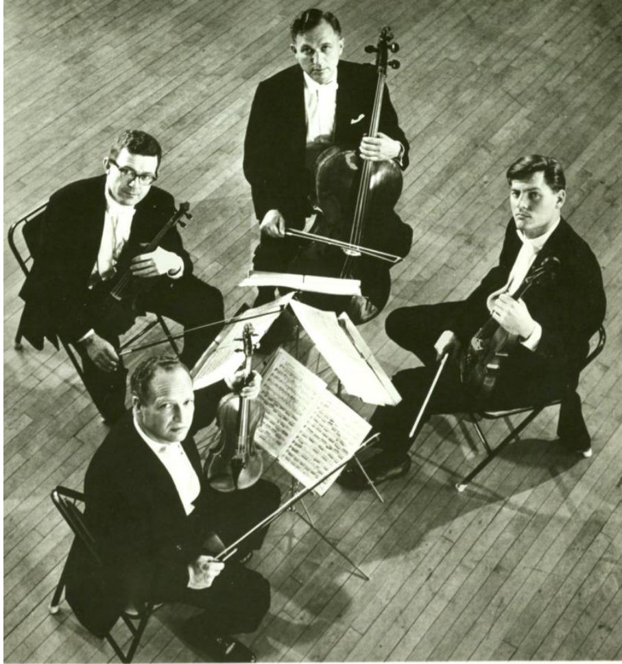
The Fine Arts Quartet (Leonard Sorkin, Abram Loft, Gerald Stanick, and George Sopkin).