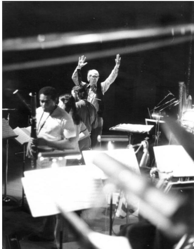
Rayburn Wright conducting the Eastman Studio Orchestra (1974).