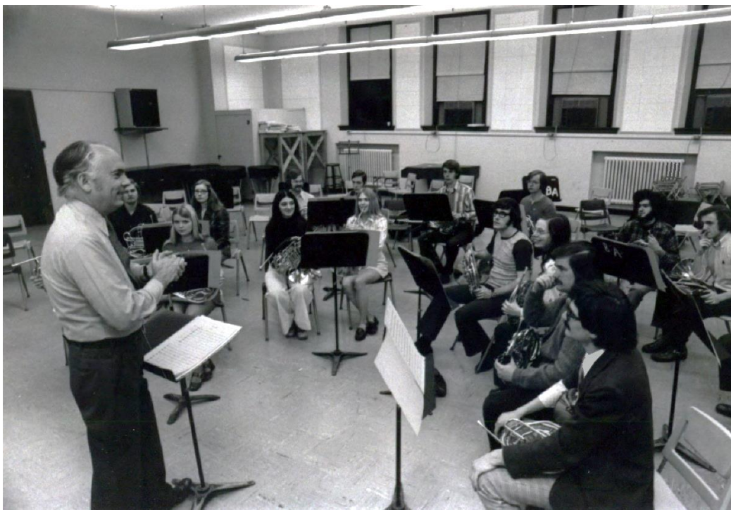
Verne Reynolds conducting student horn choir at Eastman School of Music. Photograph from Verne Reynolds Collection (2011), Box 21, Folder 3, Sleeve 22.