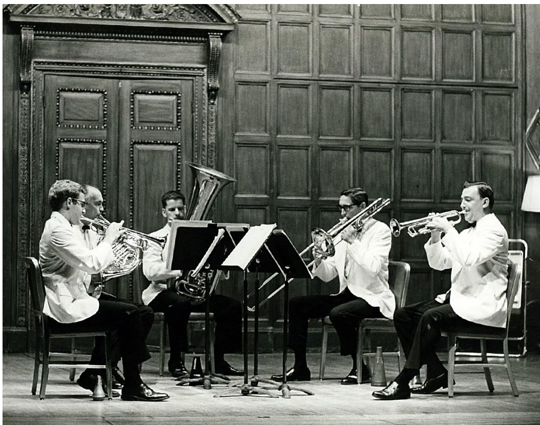
Eastman Brass Quintet in Kilbourn Hall, Eastman School of Music, Rochester, NY.